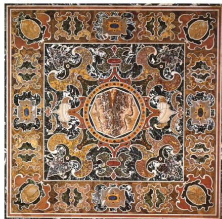
4. Piano di tavolo, post 1565, Madrid, Museo del Prado