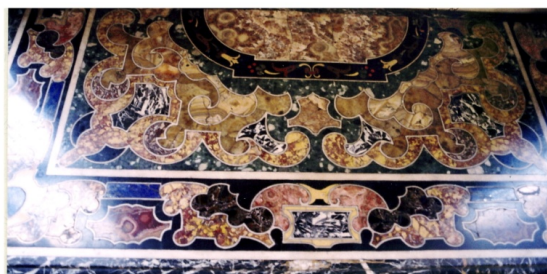
5. Piano di tavolo (part.), fine del XVI secolo, Racconigi, Castello