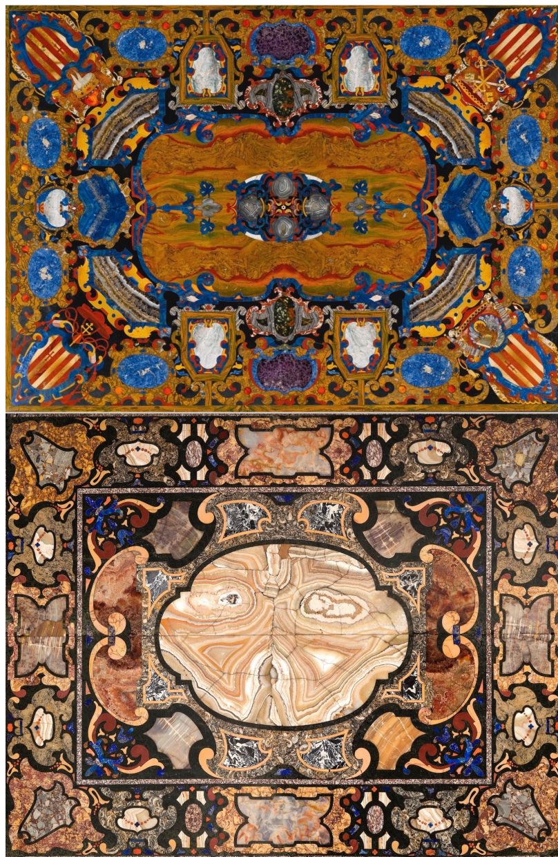
6. Piano di tavolo del Cardinale Grimani, inizi del XVII secolo and the Alessandri table.