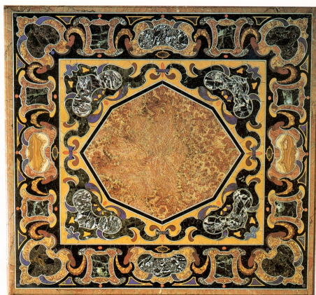
3. Piano di tavolo, fine del XVI secolo, Firenze Tesoro dei Granduchi